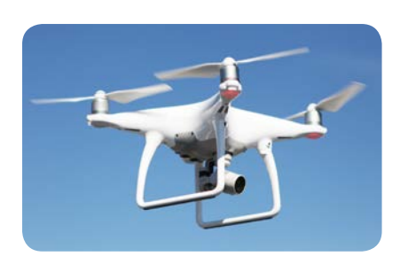
Figure C: Categories of drone operations specified by the European rules on drones.

The manual for "Drone Incident Management at Aerodromes" seeks to mitigate risks from unauthorised civilian drones with a take-off mass up to 25 kg<sup>22</sup>. Such drones are normally permitted to be operated in the "open category"<sup>23</sup>. When operated away from protected installations maintaining visual contact between the drone pilot and drone and flown below 120m height, the operational risk under the "open category" is usually considered so low, that no prior authorisation is required before starting the flight.