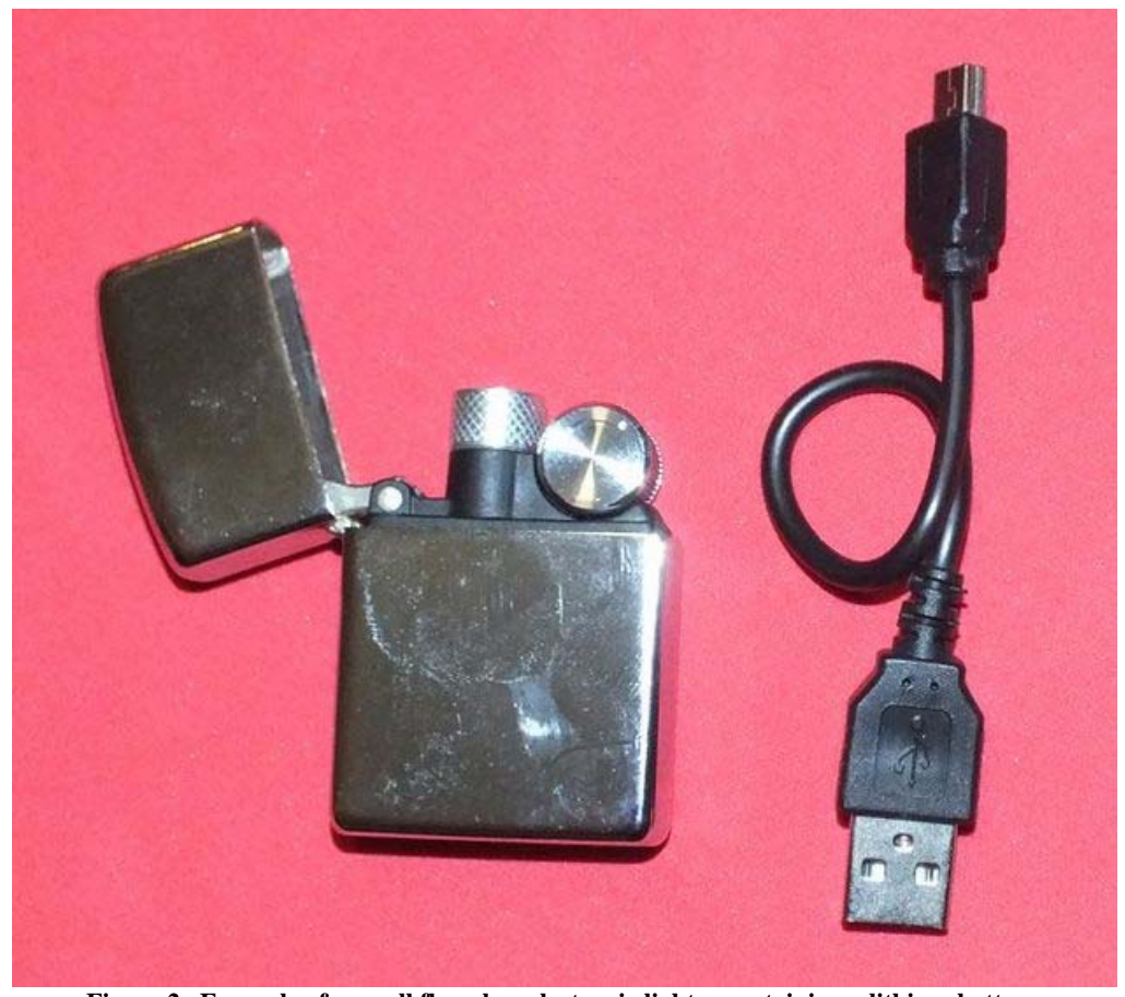
Figure 2 –Example of a small flameless electronic lighter containing a lithium battery designed to be charged via a USB cable.