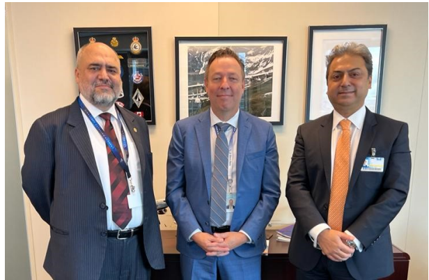
Meeting with Pakistan