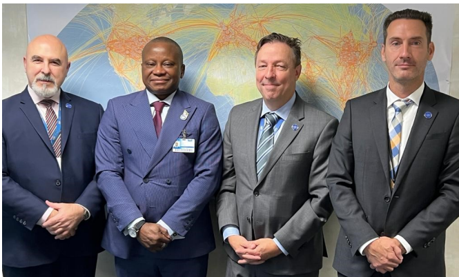
Meeting with the Democratic Republic of the Congo

Four other meetings were held with ICAO partners on fostering collaborative relations to support the USOAP CMA monitoring function. In addition, a face-to-face dialogue on contributions from the Regional Offices to the USOAP CMA was held to review the different roles and responsibilities on the programme performed by Headquarters and the Regional Offices, in addition to discussions on the main challenges encountered in the ICAO regions.