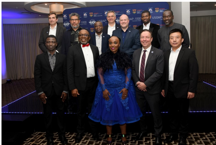
The audit team with the Hon. Sindisiwe Chikunga, Minister of Transport and the Hon. Lisa Mangcu, Deputy Minister of Transport