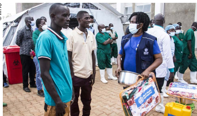
WHO and partners tour Ebola Treatment Centers in Uganda

An essential component of case management is psychosocial assistance. Ebola disease survivors and family members are often stigmatized, and unable to resume their lives following their recovery. It is therefore important that psychosocial care is integrated into the response at the earliest stage. Key activities at the national level include training providers and community leaders in essential psychosocial care; equipping teams with appropriate tools and support ; providing food/nutrition and non-food support to affected individuals and families; establishing a psychosocial action plan to combat stigma and other consequences; and assisting in the care and social reintegration of survivors and orphans.