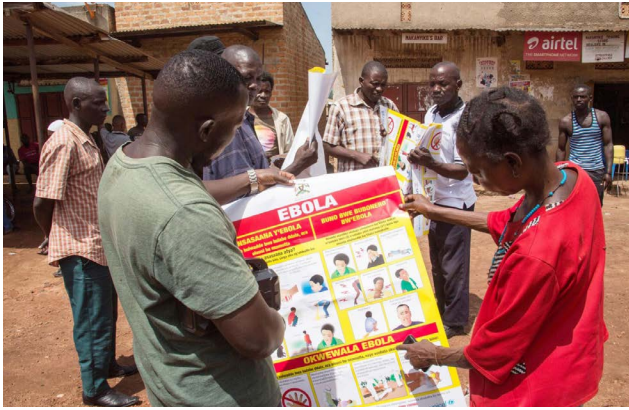
Contact tracers and village health teams take on Ebola in Uganda

to strengthening capacity in GBV, Mental Health and Psychosocial Support (MHPSS), Clinical Management of Rape (CMR) and Sexual and Reproductive Health (SRH) to ensure a holistic approach in victim assistance.