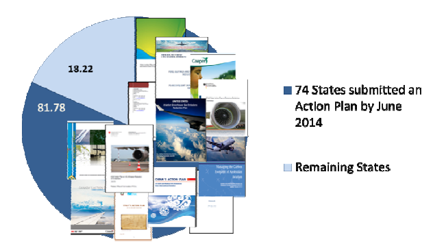
74 States, representing around 82% of global international aviation traffic, submitted a first action plan as of September 2014