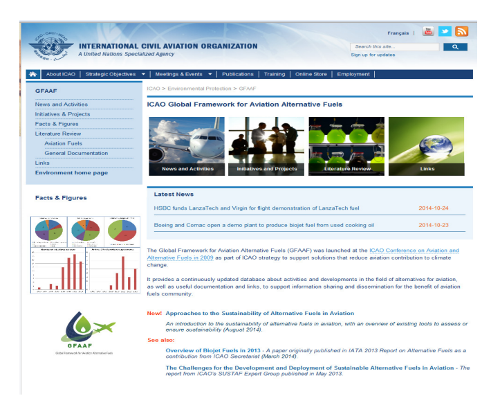
ICAO Global Framework for Aviation Alternative Fuels (GFAAF) website (<u>http://www.icao.int/environmental-protection/GFAAF/Pages/default.aspx</u>)

1.9 Technical work at ICAO on this subject focuses on a global view of the future use of alternative jet fuels and of the associated range of potential emissions reductions. In this regard, the Alternative Fuels Task Force (AFTF) under the ICAO Committee on Aviation Environmental Protection (CAEP) has been working to develop a methodology for the assessment of full life-cycle CO_2 emissions, assess the future production of alternative jet fuel, and apply the life-cycle methodology to evaluate the associated emissions reductions in future.