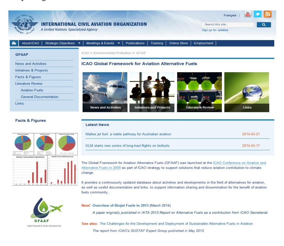
ICAO Global Framework for Aviation Alternative Fuels (GFAAF) website (http://www.icao.int/environmental-protection/GFAAF/Pages/default.aspx)

1.12 In addition, ICAO has been working with the Sustainable Energy for All (SE4ALL) initiative with a view to building partnership in promoting linkages and synergies between the aviation industry and governments on sustainable alternative fuels.