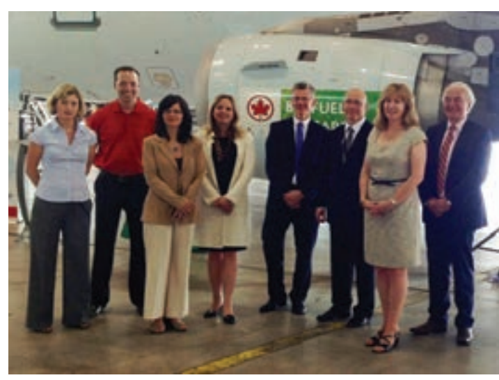
Leg 2 team members from Airbus, Air Canada and SkyNRG.