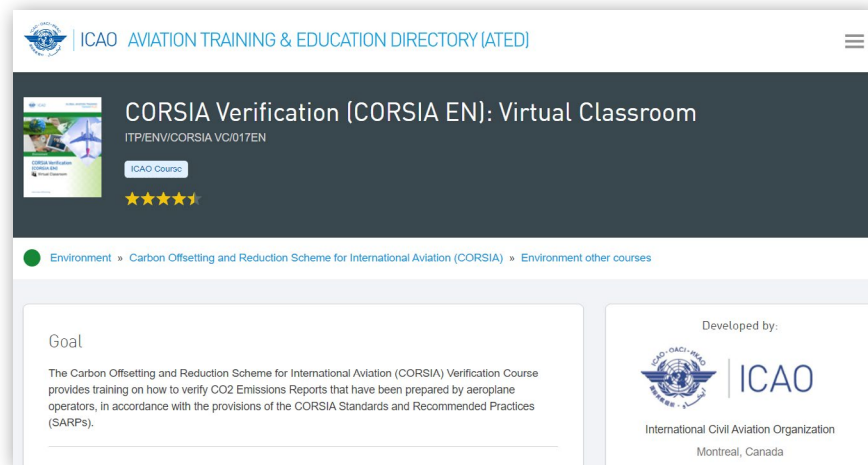
FIGURE 3: Main webpage of CORSIA Verification course