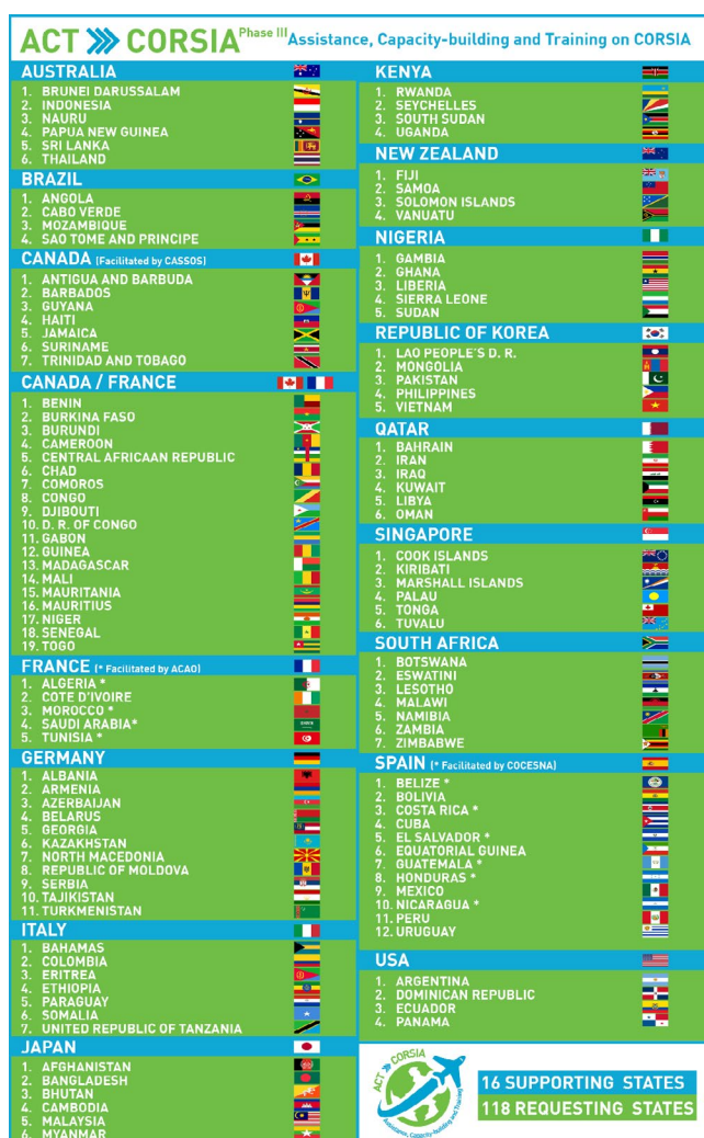
FIGURE 1: List of Member States participating in the Phase 3 of Buddy Partnerships

The list of Member States participating in the Phase 3 of the Buddy Partnerships are available on Figure 1, and further information on Buddy Partnerships can be found on the ACT-CORSIA Buddy Partnership webpage 2 .