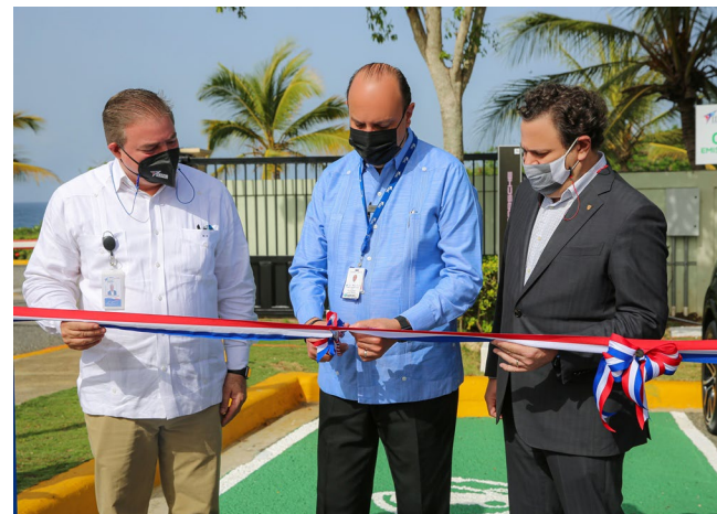
FIGURE 7: Inauguration of electric chargers for vehicles in the Norge Botello aeronautical complex

The mitigation measures implemented include the use of renewable energy sources through solar panels, implementation of chargers for electric vehicles, and other measures such as waste management. It represents an estimated reduction of 9,594 tons of CO 2 per year.