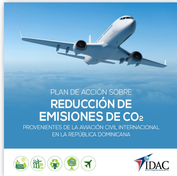
FIGURE 1: Cover of the 4th edition of the action plan

For PARE-CO 2 2021–2023, a working group was added, titled “DRWG 7 Market-based Economic Measures” This group is currently comprising government institutions such as the Dominican Accreditation Organization (ODAC). IDAC signed a collaboration agreement in July of 2021