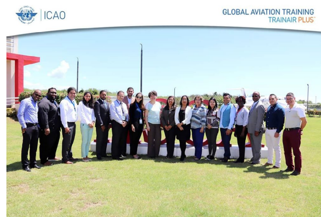
FIGURE 4: CORSIA MRV Course at the Superior Academy of Aeronautical Sciences (ASCA), March 2020

Under the ACT-CORSIA Framework, we held virtual working meetings in 2020 with the United States, Panama, and Ecuador to share best practices on the verification Body and National Accreditation Body scheme. This was of great value to the national team.