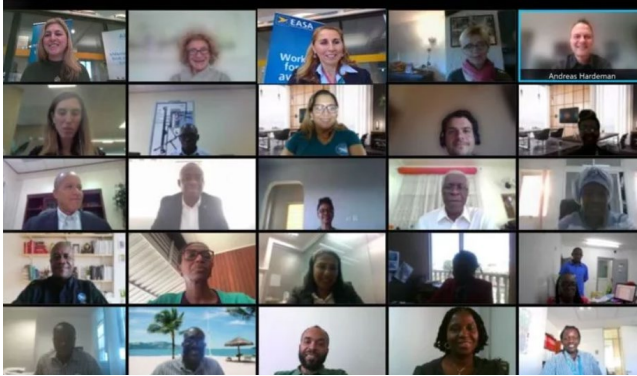
FIGURE 5: Virtual meeting CORSIA capacity building for CO 2 mitigation from international aviation - Africa and Caribbean, April 2021.