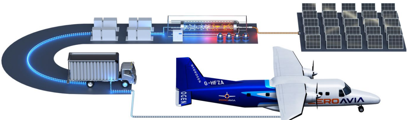
FIGURE 5: Green hydrogen powers electric propulsion using the fuel cells

For both hydrogen combustion and hydrogen fuel cell powered flight, refuelling infrastructure is a major challenge. ZeroAvia has been working to demonstrate the use case for airport refuelling, having developed its Hydrogen Airport Refuelling Ecosystem (HARE) in collaboration with the European Marine Energy Centre (EMEC). Using an onsite electrolyser at its R&D bases to produce compressed hydrogen gas which is then passed into its mobile refuelling truck, the company has been demonstrating the infrastructure for gaseous hydrogen