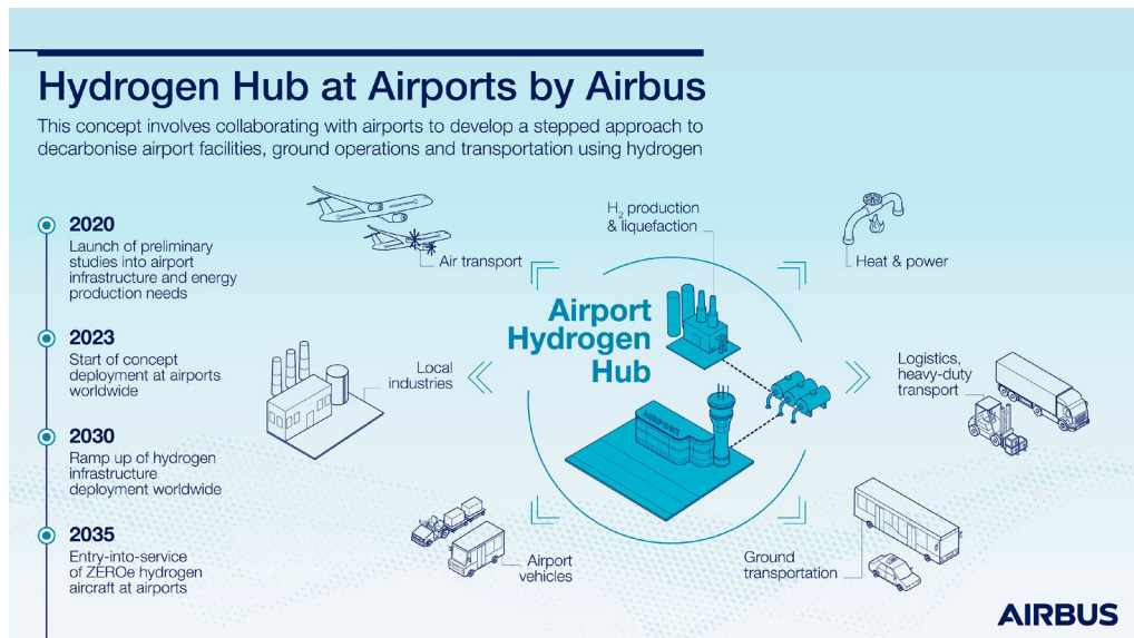
FIGURE 2: Hydrogen hub at airports by Airbus.

Airbus is also adapting and evolving existing hydrogen storage technology for use inside aircraft. Several new research and development facilities across Europe have