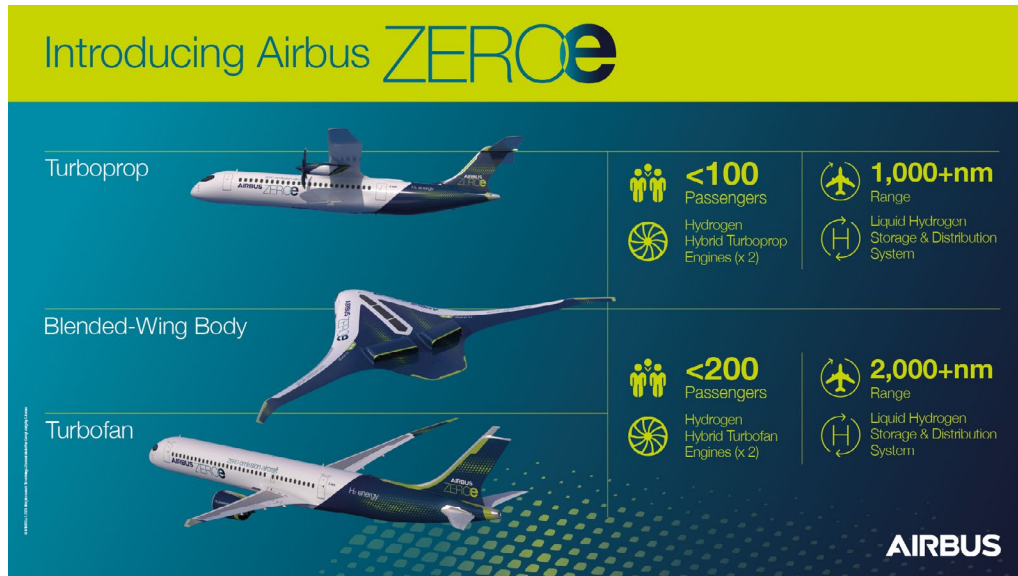
FIGURE 1: Introducing Airbus ZEROe

A down selection on ZEROe’s technology choices and aircraft configurations is expected to start as early as 2025, which means that the first hydrogen-powered airliner could be certified and ready for service entry by 2035.