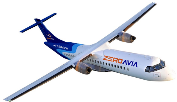
FIGURE 3: ZeroAvia

ZeroAvia has already demonstrated its hydrogen-electric powertrain technology in a six-seat Piper Malibu using a 250kW system, with gaseous hydrogen as the fuel. The company is also well advanced in the development of a 600kW system (ZA600), capable of supporting 10-20 seat aircraft with an initial range of 300 nautical miles. The company plans to certify this technology in time for entry into service by 2024 and has signed an initial deal with Hindustan Aeronautics Ltd, enabling the