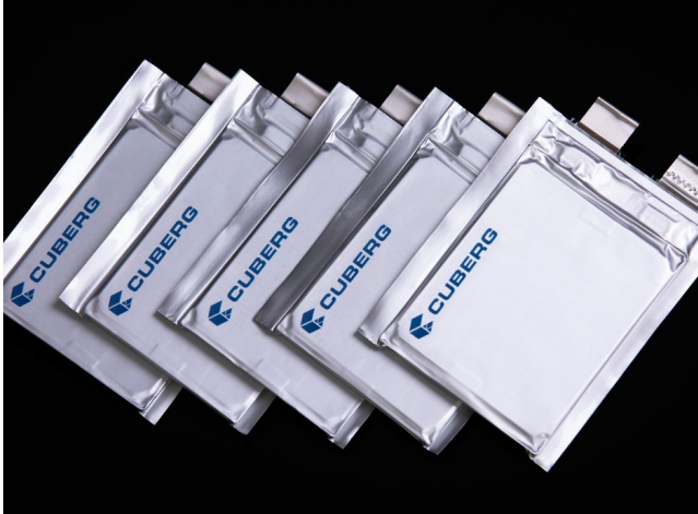
FIGURE 2: Cuberg 5Ah pouch cell batteries

Cuberg's batteries, based on its breakthrough lithium metal technology, are optimally designed for successful commercialisation. Cuberg has achieved industry-leading results in a pouch cell using technology that capitalises on the scale and quality of the existing Li-ion manufacturing ecosystem. These strengths allow Cuberg to bring next-gen batteries to the aviation market, delivering significant improvements in range and payload while preserving the substantial deployed capital base of Li-ion manufacturing.