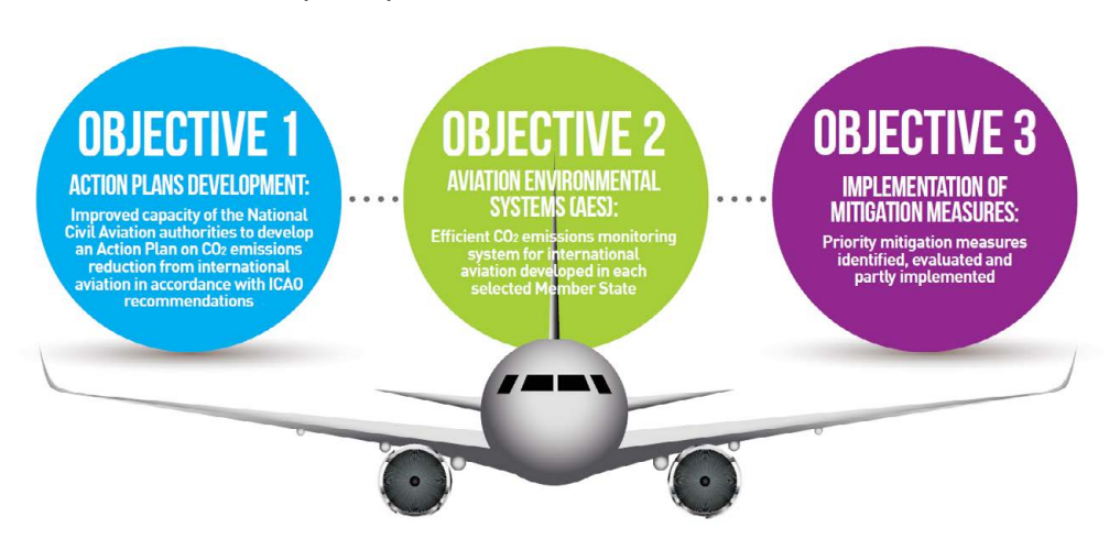
FIGURE 1: ICAO-EU Project Objectives

In 2010, Member States of the International Civil Aviation Organization (ICAO) established the Global Aspirational Goal Of Carbon-Neutral Growth From 2020 For The International Aviation Sector. The ICAO Assembly also agreed on a basket of measures to achieve this goal and requested States to develop and submit State Action Plans on Emissions Reduction on a voluntary basis. While several Member States submitted action plans to ICAO, many others require technical assistance to develop their action plans.