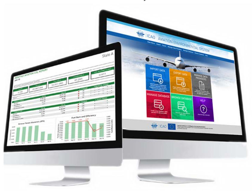
FIGURE 2: The Aviation Environmental System - AES

• Two "solar-at-gate" projects, which consist of a solar farm and airport gate electric equipment, to power aircraft with solar energy during ground operations at the international airports of Douala, Cameroon, and Mombasa, Kenya. The combination of electricity generated by the solar facility and the use of gate electrification equipment eliminates the CO<sub>2</sub> emissions while the aircraft is parked at the gate running the pre-departure procedures before departing for the next flight. The installed capacity of these projects is of 1,25MWp and 500kWp respectively, and they will eliminate over 4,000 tonnes of CO<sub>2</sub> per year and will serve more than 7,500 flights per year.