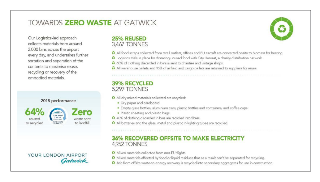
FIGURE 2: Towards Zero Waste: Gatwick's 2018 performance.

Now, materials are classified as "Wet" or "Dry" at the point of use and collection. For example, airport food and beverage outlets are required to separate items such as dry paper and card, plastic packaging, empty bottles and food scraps for collection. In the terminals, passengers are asked to put empty bottles, cups and newspapers in