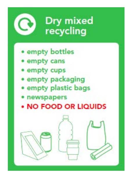
FIGURE 4: New, clearer recycling signage to encourage waste segregation has been deployed across the airport

Gatwick's passenger website and app, and the signage at the entrance to Security screening areas, provide visible messaging to passengers that they can take an empty bottle through security and refill it at water fountains in the departure lounges. Free water refills are also provided by all of Gatwick's food and beverage outlets.