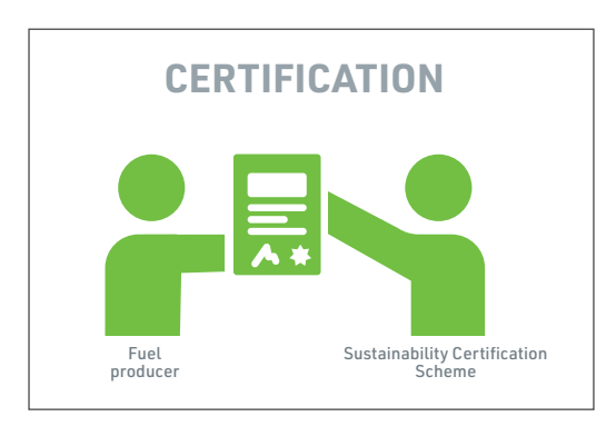
FIGURE 3: Sustainability Certification

Many aviation fuels already go through a voluntary or regulatory sustainability certification process, but the method described below refers to the CORSIA-specific process recommended by CAEP.