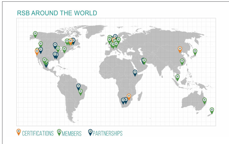
FIGURE 1: RSB's Involvement with Worldwide Aviation.

stakeholder consultation processes, and more. All of this can lead to RSB Certification or provide a roadmap for achieving it as markets grow. On a larger scale, RSB works at regional or national levels to do the following: develop indicators which benchmark local policy against the RSB Standard, identify crossover and gaps, reduce the time and effort involved in attaining certification, and help governments understand where to direct legislative efforts.