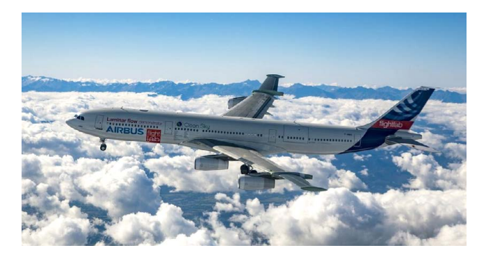
FIGURE 2: Integrated wing NLF (Natural Laminar Flow) integration concepts installed on modified outboard wings of A340-300 (Clean-Sky 2 flight demonstrator BLADE) (Ref. 3)

On wings of very large aircraft and on geometries with significant sweep such as a vertical fin, laminar flow can only be realized using suitable surface suction (Hybrid Laminar Flow Control, HLFC ). Recent flight testing of a vertical-fin HLFC configuration on a single-aisle aircraft under the European AFloNext (Active Flow, Loads & Noise control on Next generation wing) program (Figure 3) complements first HLFC application on the Boeing B787 tail. Overall, practical and robust achievement of significant laminar flow on wings and other surfaces could reduce aircraft fuel burn on order of 5%. The magnitude of potential benefit depends on the fraction of airplane surfaces manufactured to achieve laminar flow.