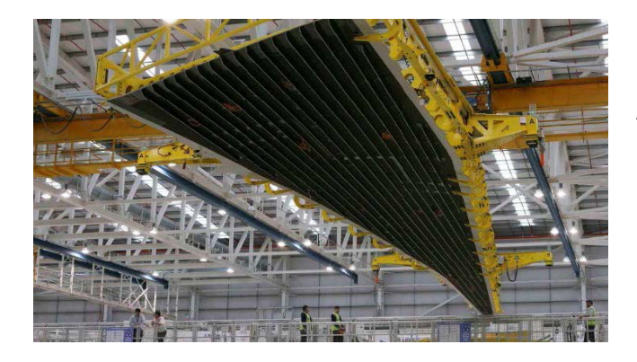
FIGURE 7: Composite upper wing skin with composite stiffeners for Twin-Aisle aircraft (Ref. 7)

Materials and structural design and optimization is now more efficient thanks to greatly improved computational simulation methods. This improved capability can be coupled with new design and manufacturing technologies like ALM (Additive Layer Manufacturing) to further reduce structural weight while optimizing load-carrying