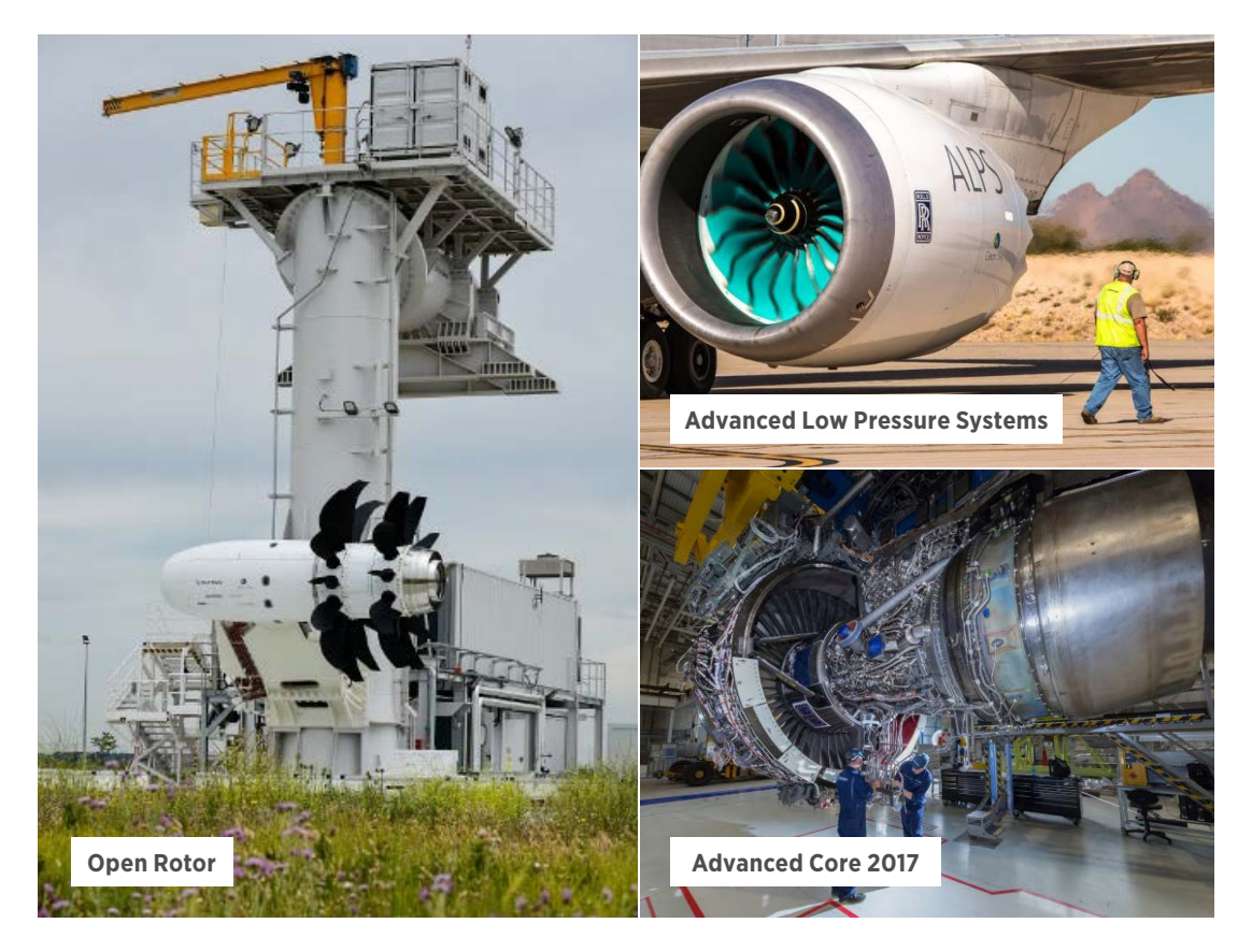
FIGURE 6: Ground and Flight Demonstrators in Clean-Sky 2 Program (Ref. 4).

Beyond these demonstrator examples, research into future more radical propulsion system architectures, such as hybrid-electric and distributed-propulsion opportunities, are being pursued by government, academia, and industry.