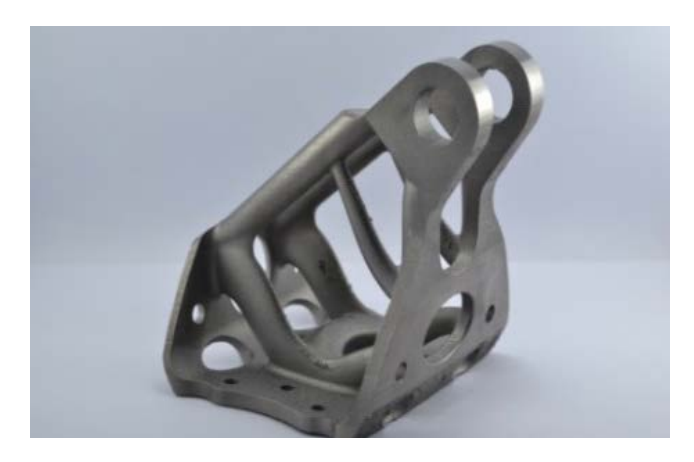
FIGURE 9: ALM wing spoiler component with "bionic" type structural optimization (Ref. 8)

FIGURE 8: Additive manufacturing of optimized part for reduced component weight