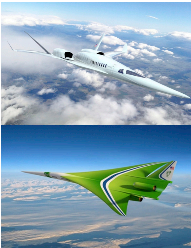
Figure 3 & 4. Examples of Boeing and Lockheed Martin Entry Level Supersonic Commercial Concepts.