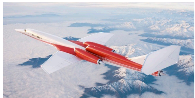
Figure 5. Aerion AS2 Supersonic Aeroplane.

Aerion Corporation, based in Reno, Nevada, anticipates program launch of its AS2 business jet in 2016, first flight in 2021, and certification in 2023 (Figure 5). Aerion intends for the AS2 to cruise at Mach 1.4 over oceans and uninhabited areas, and operate at “Mach Cut-off” over populated areas (see Mach Cut-off in introduction). In areas prohibiting cruise above Mach 1, the AS2 can cruise at Mach 0.95 with full range capability. Aerion is considering a family of aircraft, including small supersonic airliners, and has secured firm orders for twenty AS2 aircraft from Flexjet with deliveries as early as 2023.