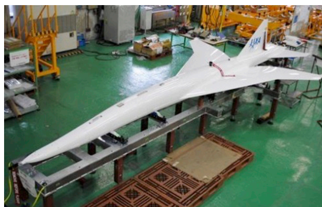
Figure 2. JAXA's Scaled Airplane – Used During Drop Test

Following this vision, JAXA is considering a new supersonic research program starting in fiscal year 2016 as a successor to its S-cube program. Its main focus will be aircraft noise reduction technologies to accommodate the recent ICAO Chapter 14 noise standard. This program will also include sonic-boom mitigation technology and evaluation research for the ICAO sonic-boom standard development process.