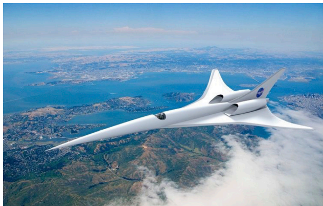
Figure 1. Low Boom Flight Demonstrator Concept

The LBFD research aircraft, though smaller than future supersonic jets, will serve as a test bed to evaluate the effectiveness of the low-boom design process and accuracy of acoustic propagation codes. Also, by flying LBFD over preapproved populated areas, the reaction of communities can be assessed systematically, providing validation for community response models under development. 1