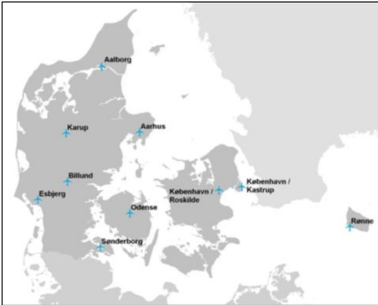
Figure 1. Danish Airports with more than 15,000 passengers per year

Regarding ownership, Copenhagen Airport A/S is a shareholder company, of which the Danish state owns 39.2% of the shares. Today, the Canadian pension fund Ontario Teacher’s Pension Plan Board (OTPP) is the second largest shareholder. The other larger provincial airports are owned by the municipalities, except Roskilde Airport, which is owned by Copenhagen Airport A/S, and the state-owned Bornholms Airport.