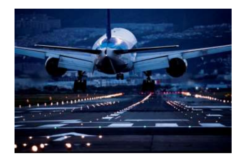
Annex 6 Part I (Part II), 4.4 In-flight procedures