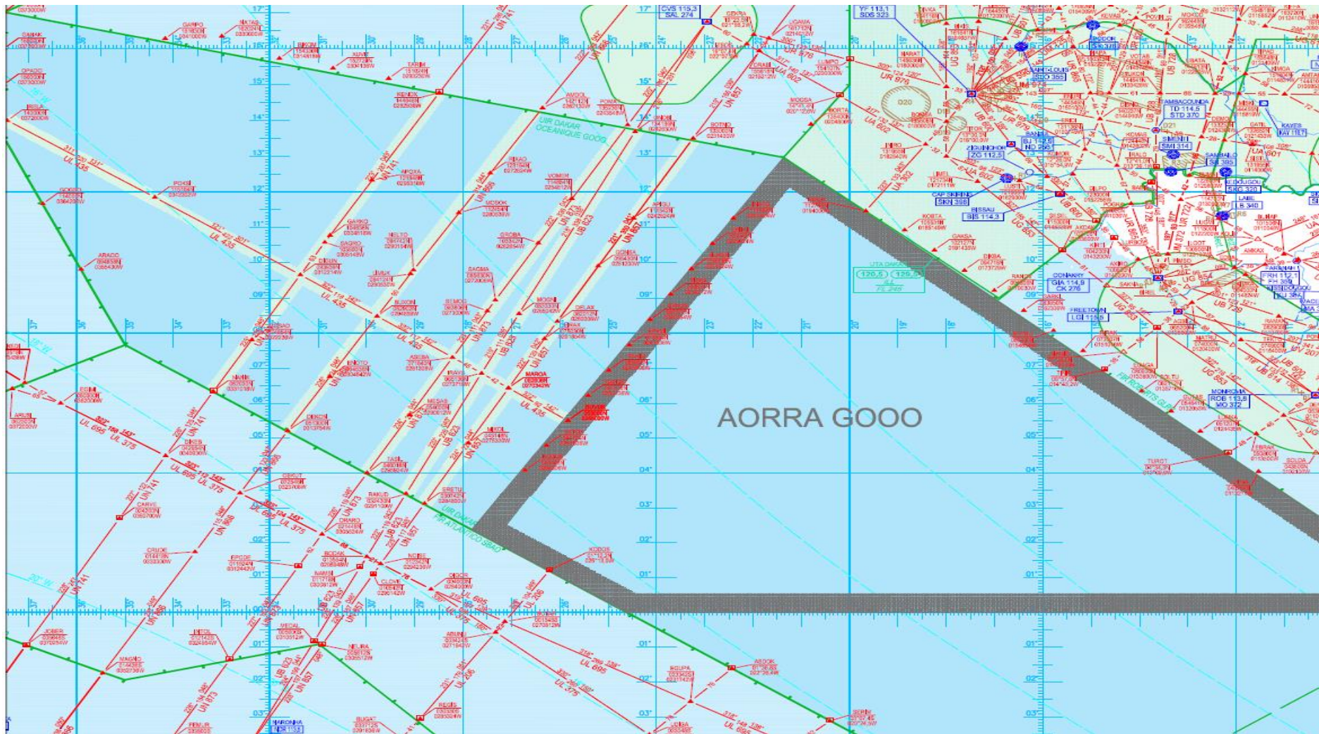
APPENDIX D - CONTINGENCY CHART IN DAKAR OCEANIC FIR (ASECNA)