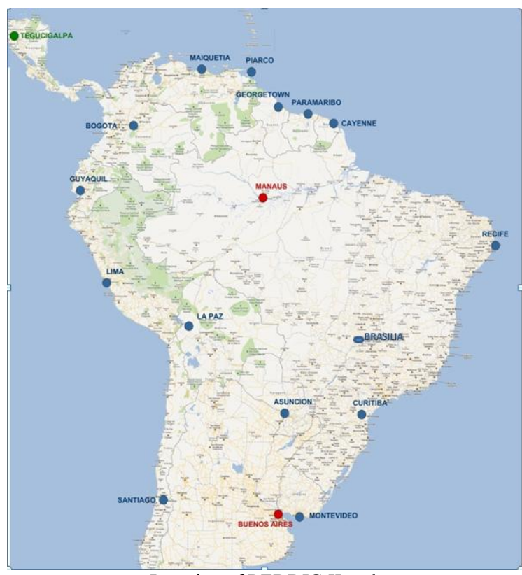
: Location of REDDIG II nodes