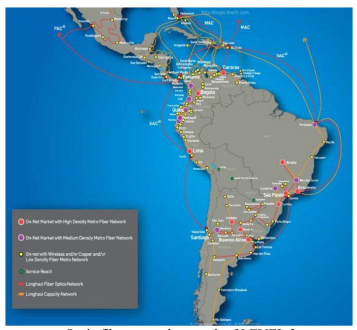
Optic fiber ground network of LEVEL 3