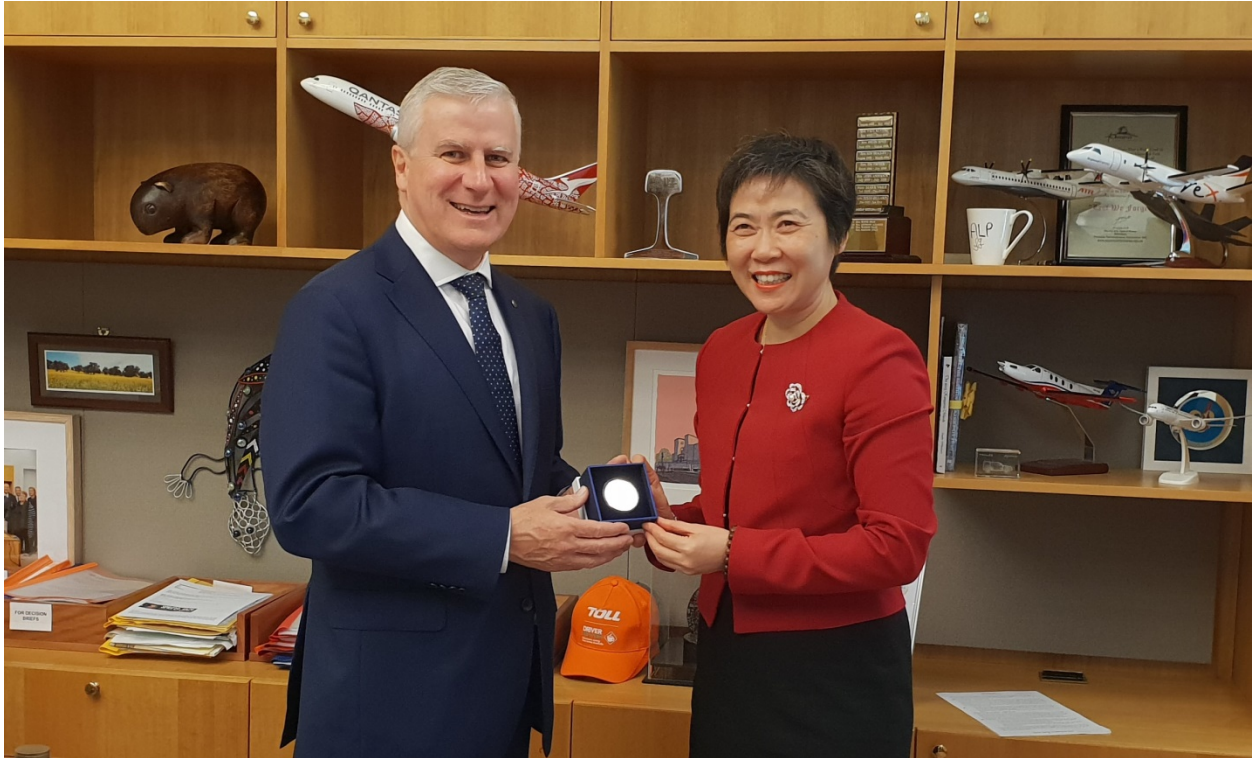
Top: The Secretary General of ICAO, Dr. Fang Liu, presents an ICAO 75th Anniversary souvenir to the Australian Deputy PM and Minister of Transport and Regional Development, the Hon Michael McCormack MP, following discussions with the Australian government on cooperation with ICAO to support regional and global aviation initiatives. The bilateral meeting coincided with Australia's Safeskies Conference in Canberra, at which Dr. Liu presented the flagship Sir Reginald Ansett Memorial Lecture.