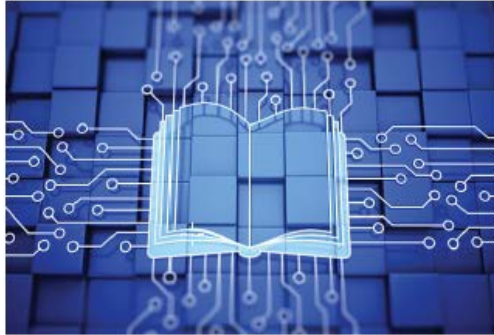
AIM Guidance material