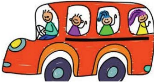
Results-based implementation (RBI) support