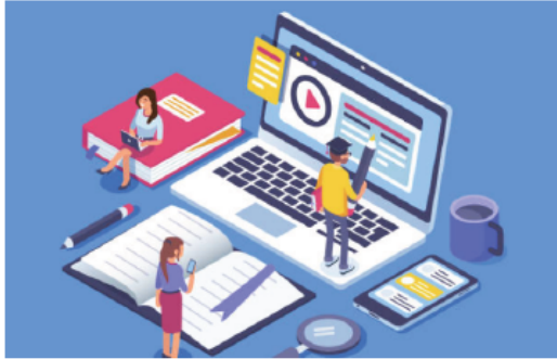
AIM Training Programmes