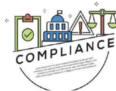
The ICAO AIM recognition of compliance