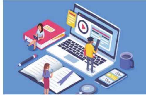
AIM Training Programmes