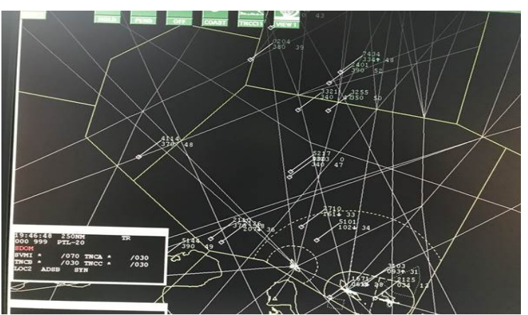
Figure 2: Curacao Raytheon AutoTrac Test Platform

2.2.5 Aireon established the 'A' side connection in Curacao during the week of May 27<sup>th</sup>, The integration entailed activating Aireon data delivery through the AT&T MPLS line, converting ASTERIX data to a message format that will be accepted by Curacao's Automation platform, and validating target update and positional accuracy in the TCNF FIR. Aireon, in partnership with Curacao, successfully integrated Space-Based ADS-B data on their test platform on 30 May 2019. See Figure 2 for a screenshot of Space Based ADS-B on a DC-ANSP's automation platform.