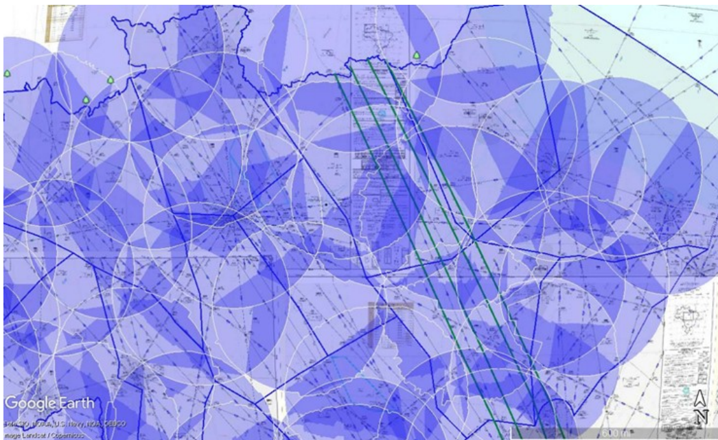
Figure 2 – VHF coverage