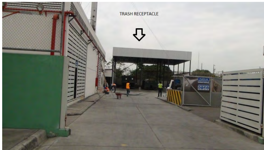
Trash collection area

During the second site visit, the GYE trash and recycling area was toured. The trash collection area and recycling transfer station were very well maintained and free of wildlife and birds.