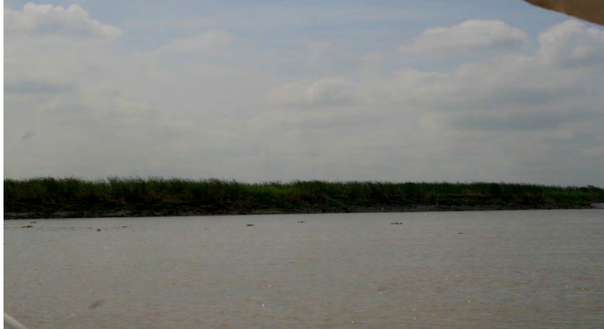
Isla la Palmar