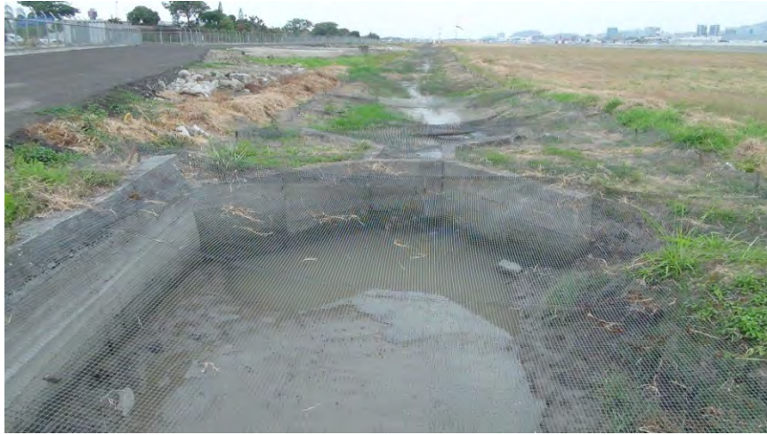
Large construction piles and mounds of dirt removed along canal

This debris provided cover and foraging sites for various bird species. It was noted during the second site visit that the construction piles and mounds of dirt had been removed as recommended. This action eliminated perching areas used by hawks and other birds.