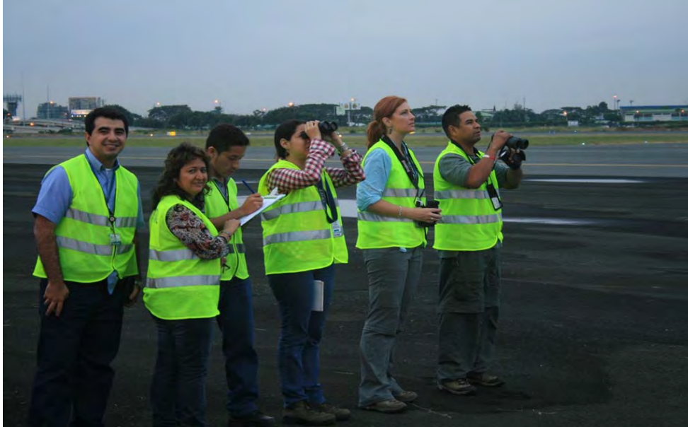
Airport Wildlife Team