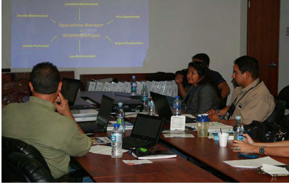
Training class at GYE

The USDA wildlife biologists provided a full day of training to airport personnel who are involved in the airport wildlife hazard mitigation plan. The training covered habitat management, wildlife management, and how to develop a wildlife hazard management plan.