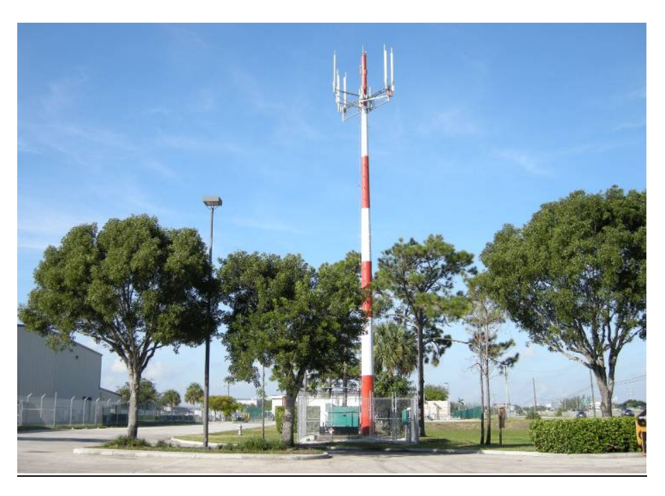
Typical Radio Site Equipment