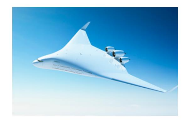
PROTOTYPES COMPETITION AGES 18 AND OVER