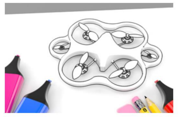
CONCEPTS COMPETITION AGES 13-17