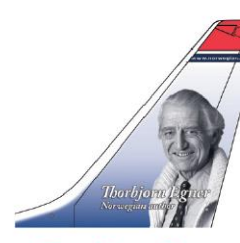
Thorbjørn Egner Norwegian writer