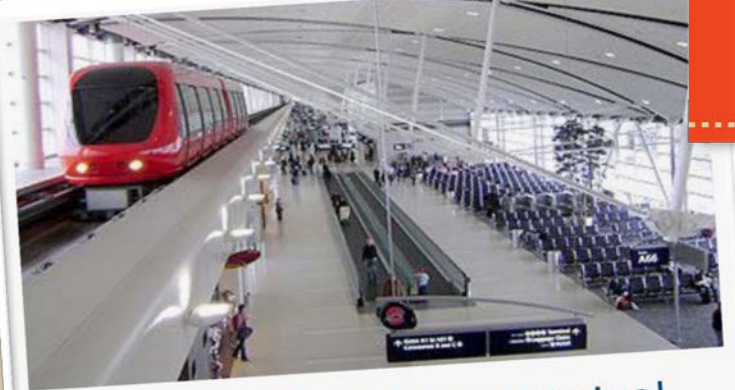
Detroit McNamara Terminal