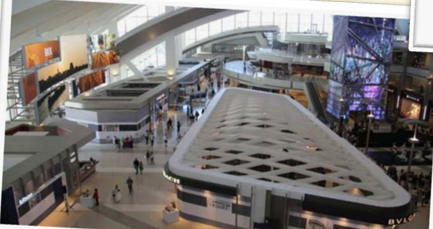
LAX Bradley Int'l Terminal