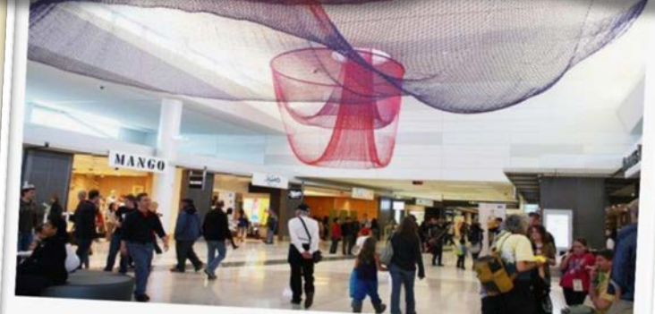
San Francisco Terminal 3