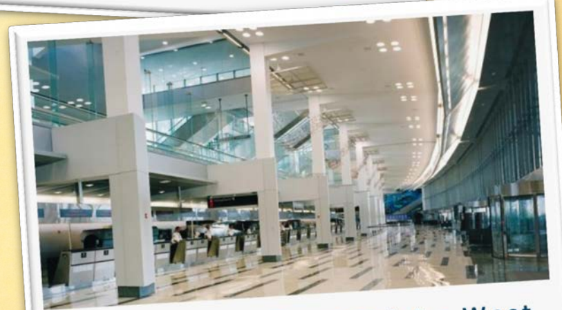
Philadelphia Terminal A - West