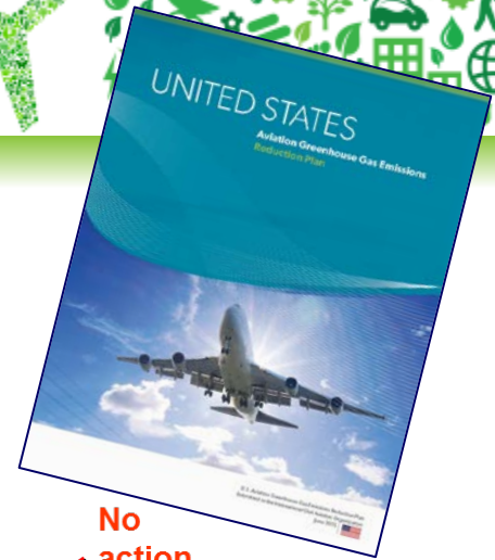
Int'l Aviation CO 2 emissions