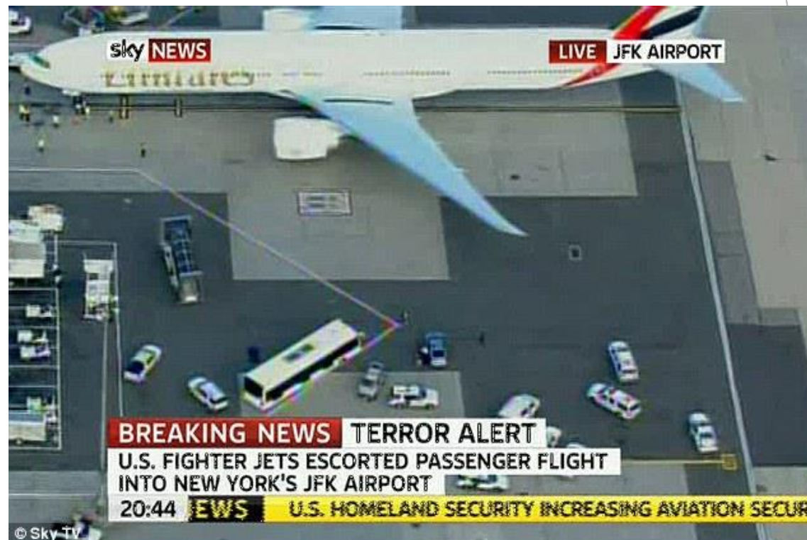
The Yemen incident, 2010