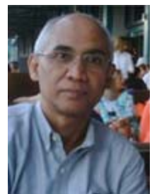
Dr. Wendy Aritenang Special Adviser to the Minister of Transportation Indonesia