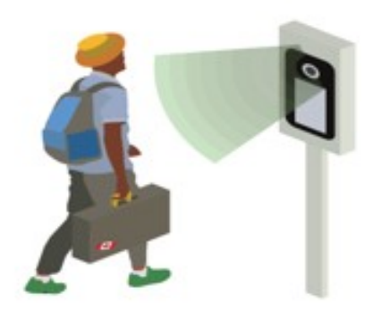
Seamless arrival into the country