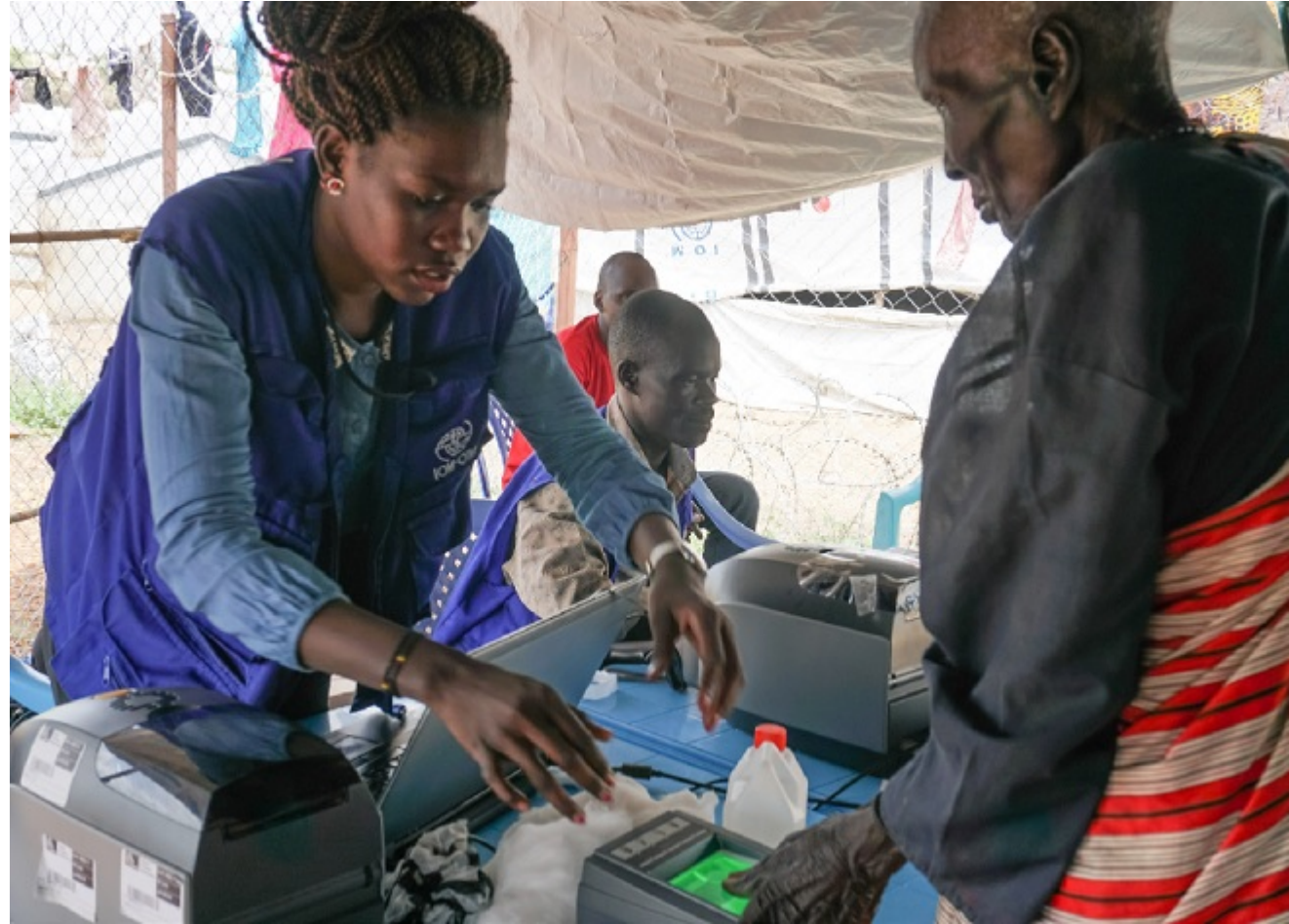
IOM conducts biometric registration exercises at the UN House, South Sudan.