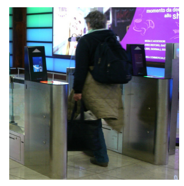
Open Security Gate

Match flight, name and facial to open gate