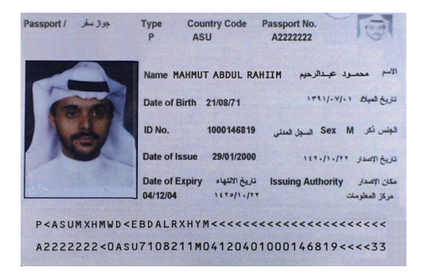
Figure 2: Transcription in the VIZ and transliteration in the MRZ

4.3 The result of using this look-up table process is a mapping of the original name in Arabic to an exact Latin representation, and this is a true transliteration. The evidence for this claim is that the original name in Arabic script can be recovered from this Latin transliteration.