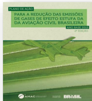
Action Plan Second Edition Base Year 2015