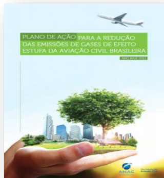
Action Plan First Edition Base Year 2013