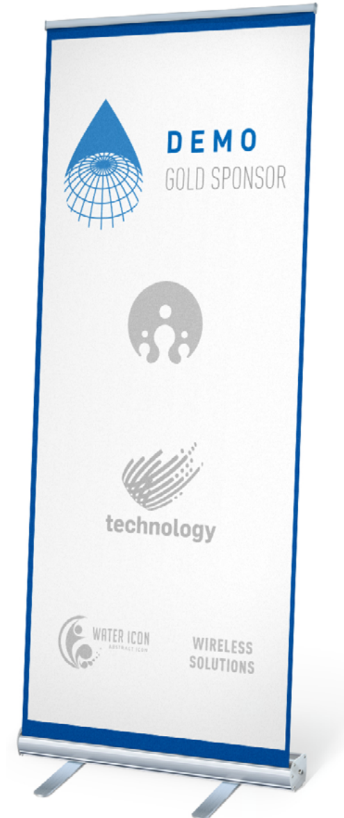
Display of sponsor's logo in the venue areas*