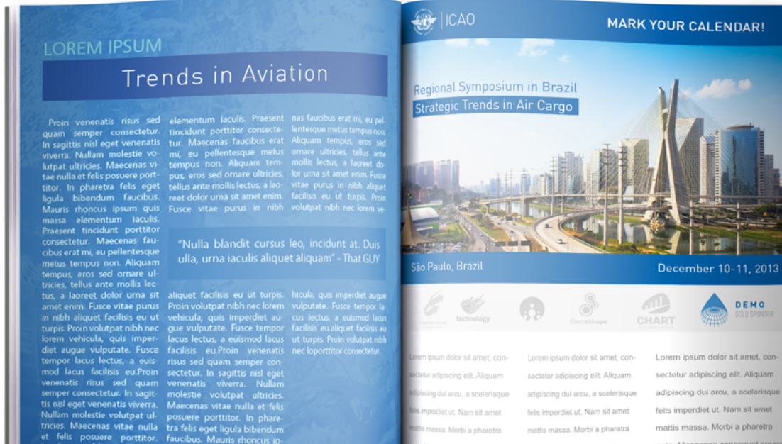
Sponsor's logo on main printed advertisement*