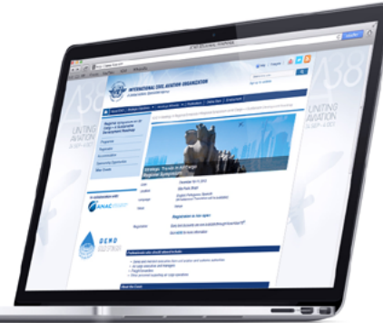
Sponsor logo on event web site (Linked to sponsor's website)*