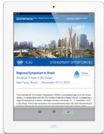
Sponsor logo on email marketing campaigns*

*The following product mockups illustrate select gold sponsorship privileges and may not be exactly as shown