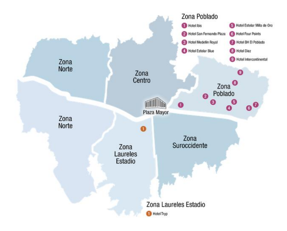
Figure 2. Hotels selected for the Assembly

For more information, visit the following link: http://eventos.aviatur.com.co/hoteles/