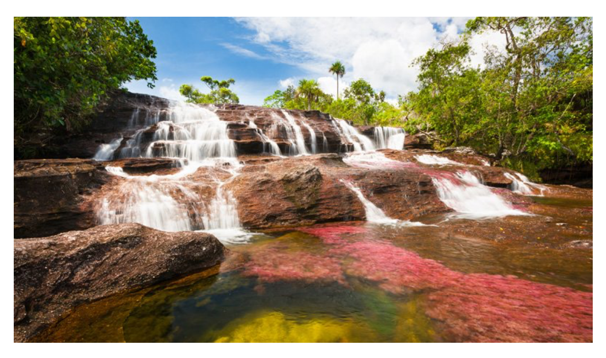
The Sierra de la Macarena is home to this fascinating river.