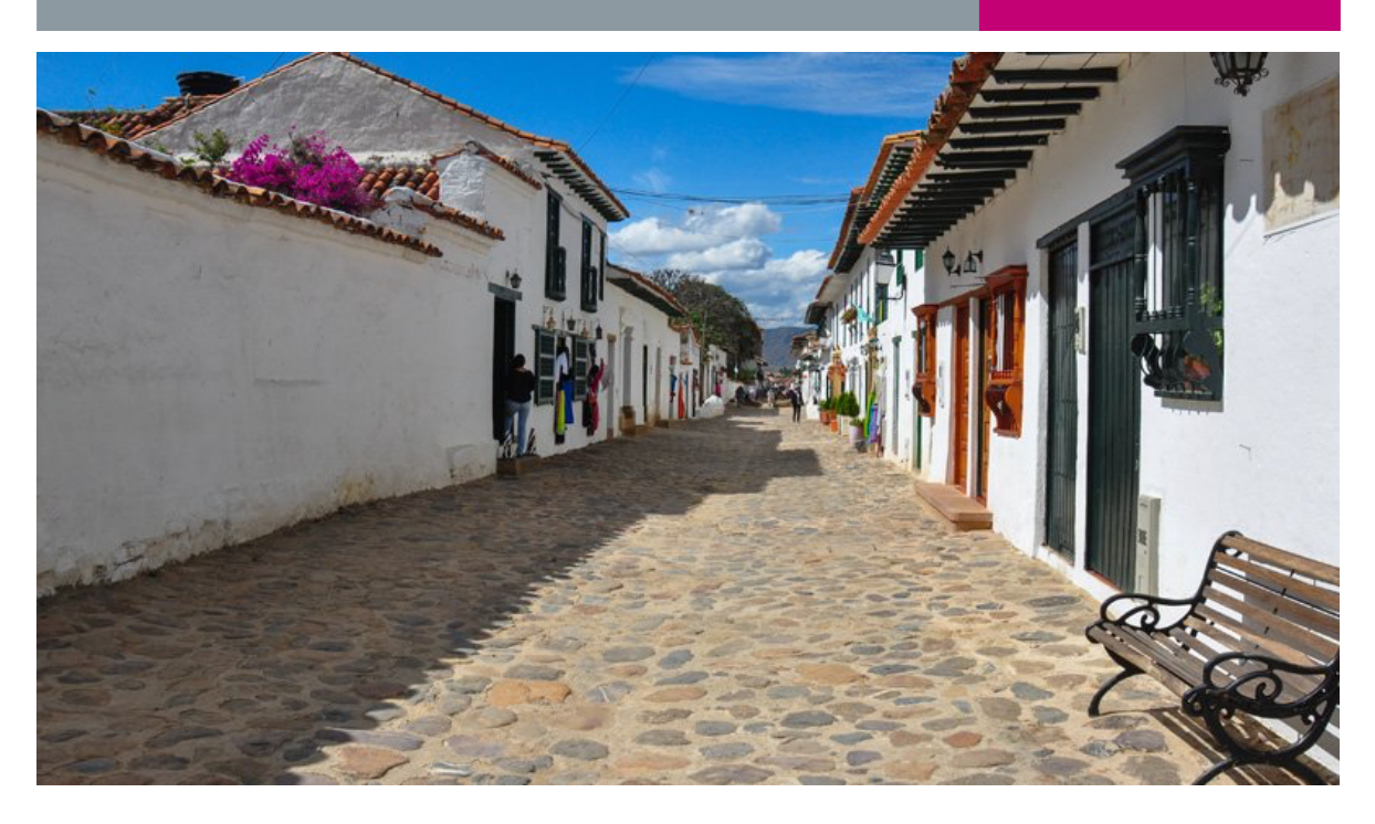
Villa de Leyva's colonial architecture will take you on a journey across the ages.