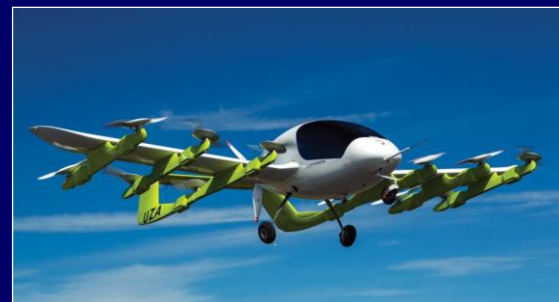
Cora - Kitty Hawk, USA