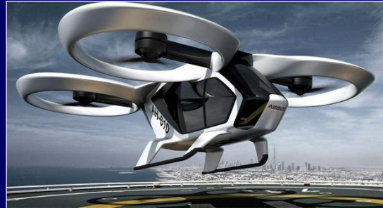
CityAirbus - Airbus, Europe