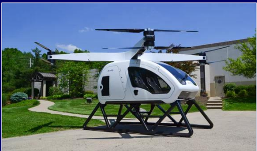
Surefly - Workhorse, USA