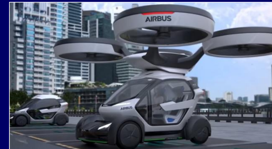
PopUp - Airbus, Europe