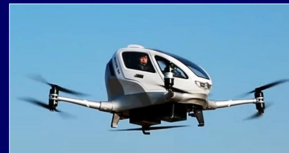
Ehang 184 - EHang, China