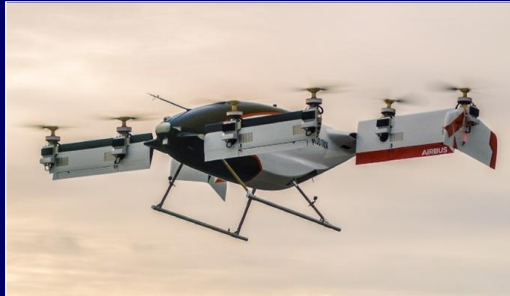
Vahana - Airbus, Europe