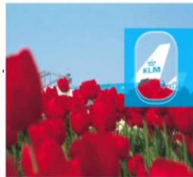
Sep '11 + Feb '12: AMS-PAR serie