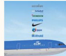
Bio Jet Fuel End Users

...by partnering with relevant stakeholders