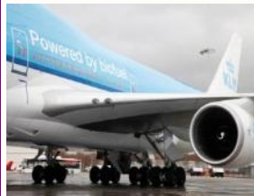
Nov '09: demo flight