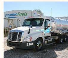
Bio Jet Fuel Logistics