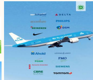
March '13: JFK-AMS serie