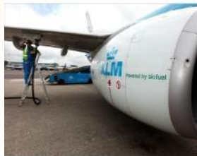
Jun '11: 1st commercial flight