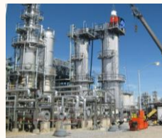
Bio Jet Fuel Production