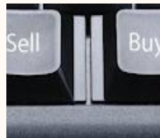
Bio Jet Fuel Trading