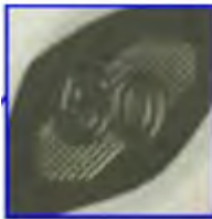
Transparent window with relief sensible when is touched