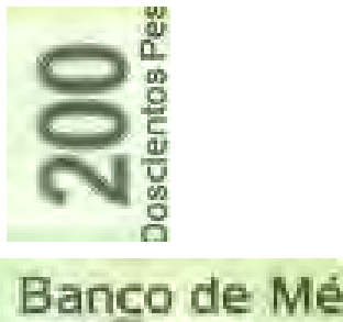
Transparent window with relief sensible when is touched