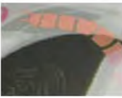
Elements that change color