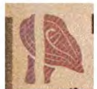
Elements that change color