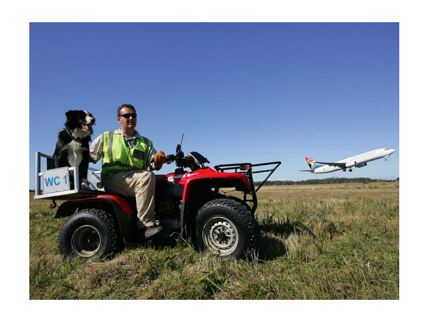
FALE uses bird radar to monitor bird activity