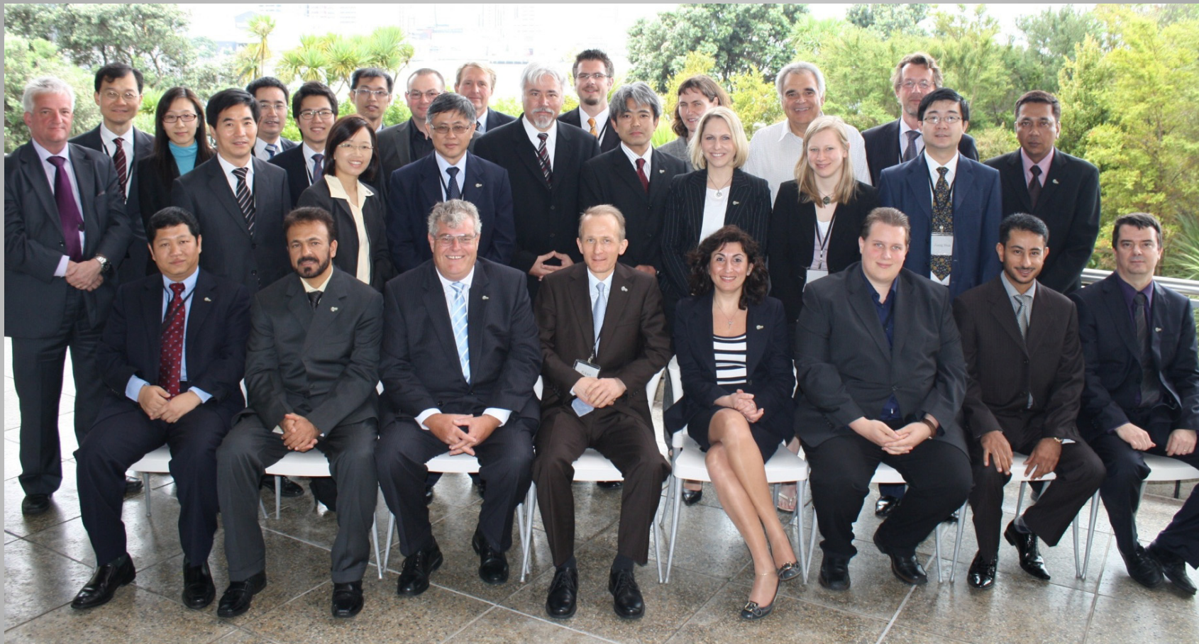
Seventh Symposium and Exhibition on ICAO MRTDs, Biometrics and Security Standards, 12 to 15 September 2011, Montréal