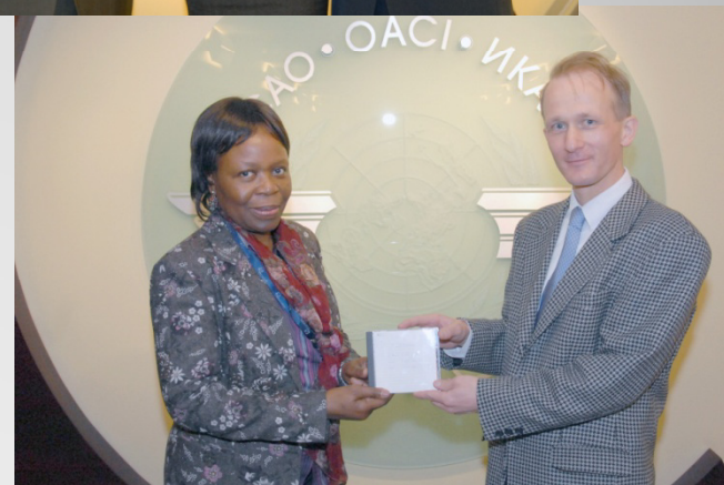
Seventh Symposium and Exhibition on ICAO MRTDs, Biometrics and Security Standards, 12 to 15 September 2011, Montréal