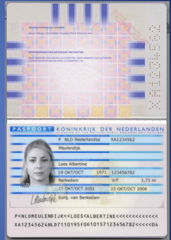
Part 1 – Passport ePassport