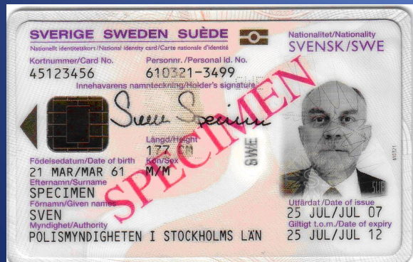
Part 3 - Official Travel Document