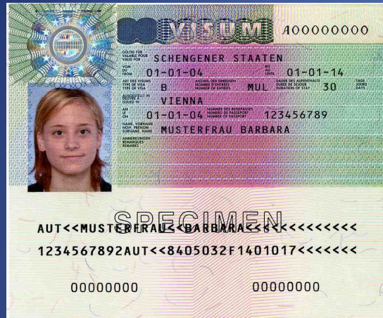
Part 2 - Visa