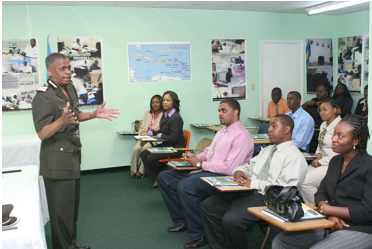
Seventh Symposium and Exhibition on ICAO MRTDs, Biometrics and Security Standards, 12 to 15 September 2011, Montréal