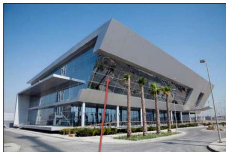
MID FPP Manager Office